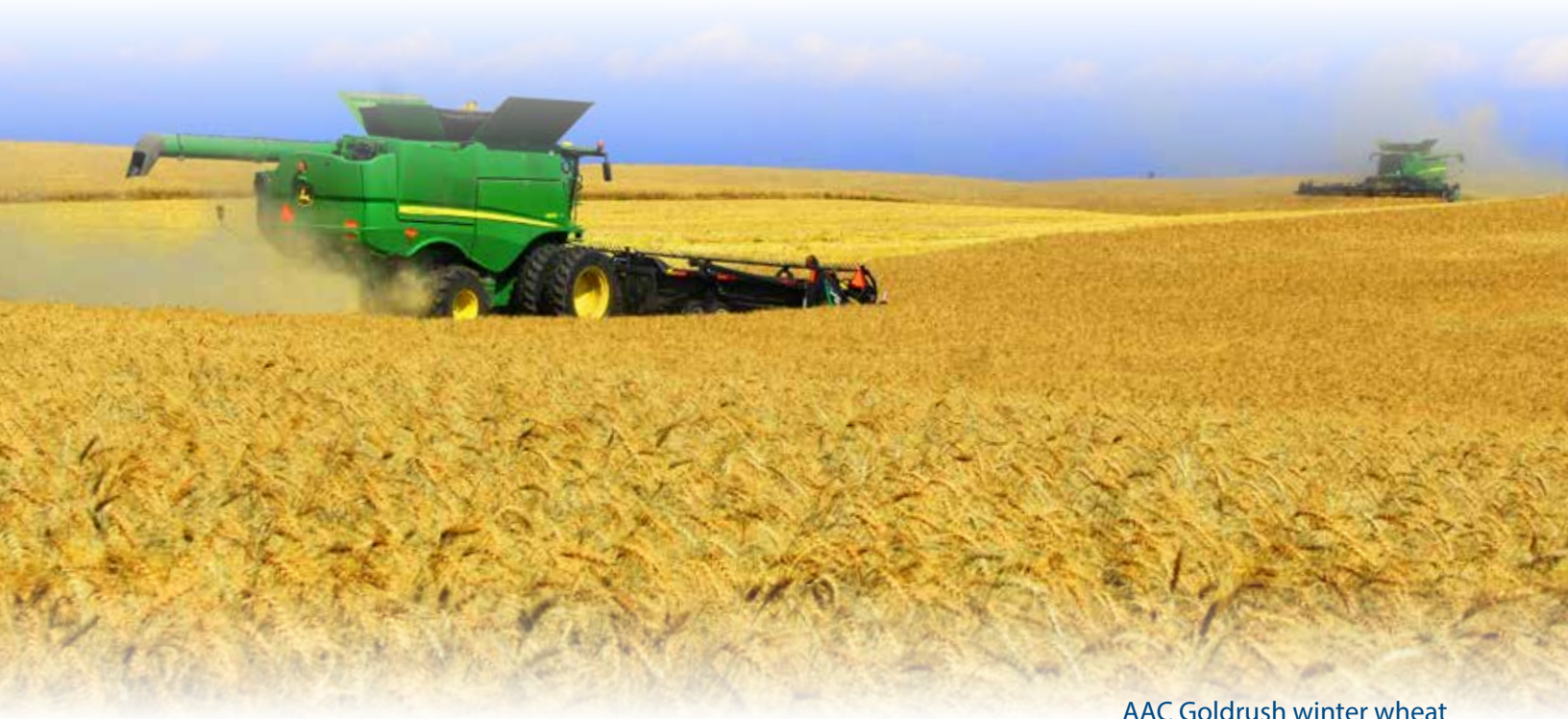
AAC Goldrush winter wheat harvest near Oakburn MB

Diversify your rotation with high-yielding, disease-resistant winter wheat. Reduce spring workload. Harvest early. Increase profitability. Reduce soil erosion. Manage herbicide resistance. Increase effectiveness of crop protection products.