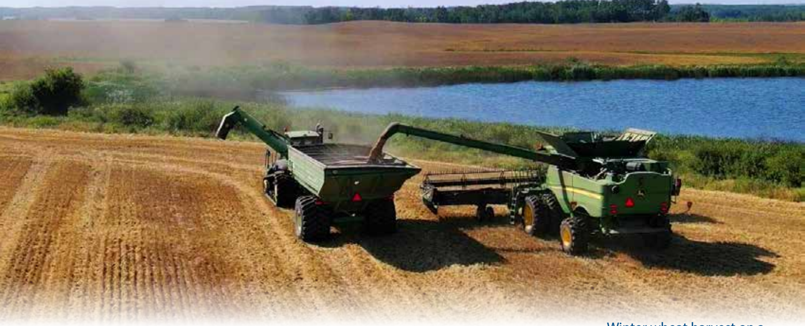
Winter wheat harvest on a farm near Sandy Lake MB