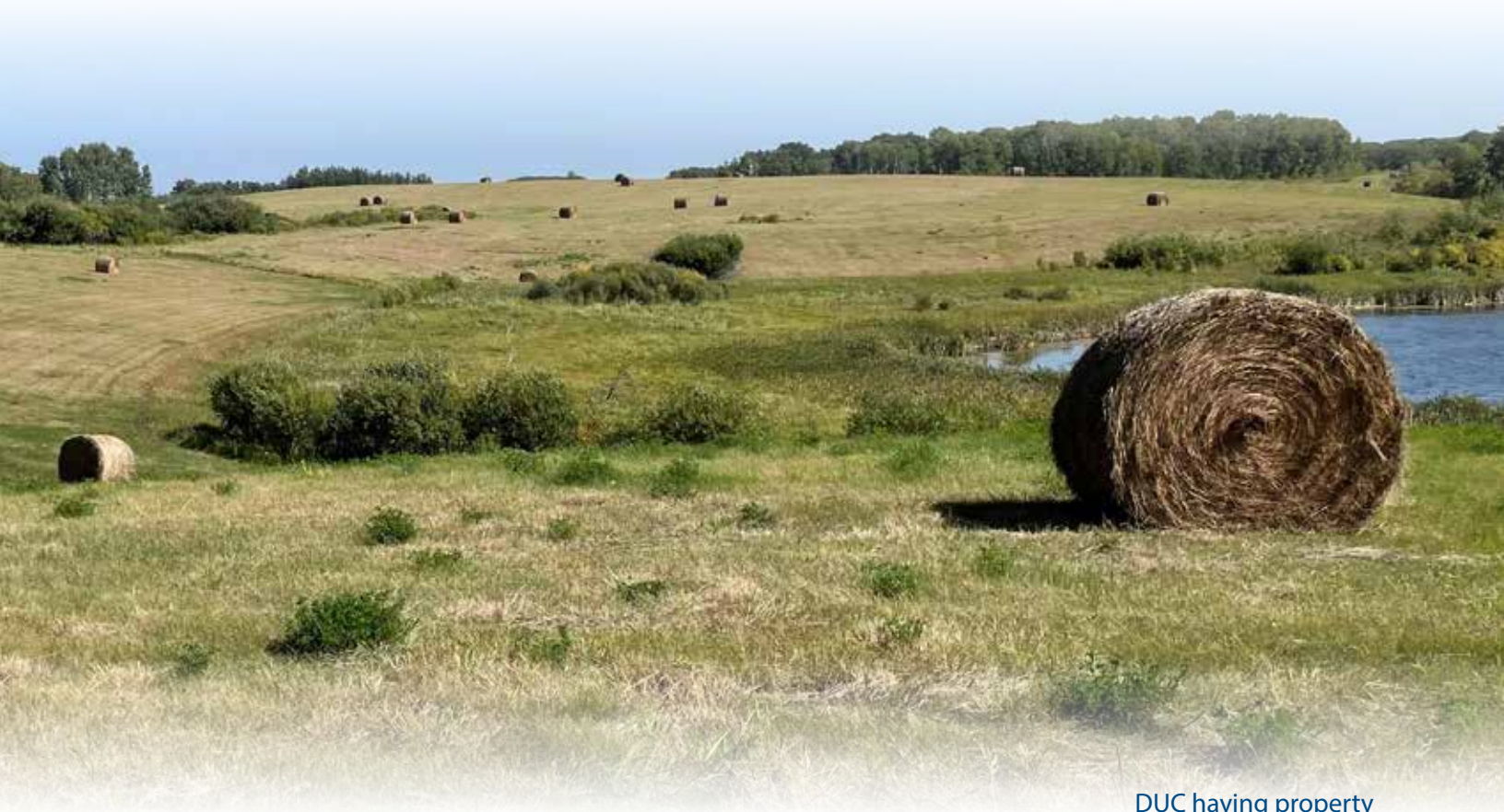
DUC haying property near Elphinstone, MB