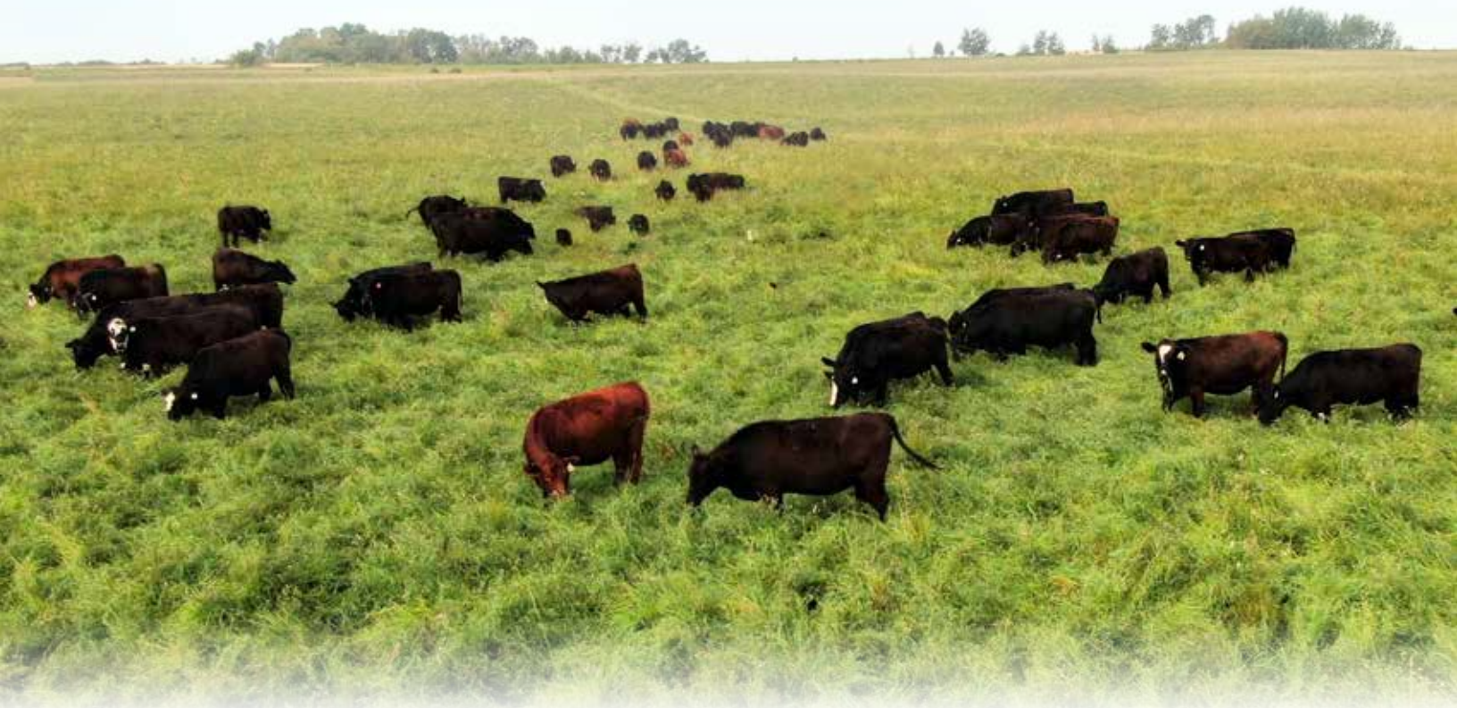
Rotational grazing near Rapid City MB

Receive up to $5,000 per quarter section for improvements. DUC will provide personalized support to optimize grassland productivity through infrastructure incentives and a grazing management plan.