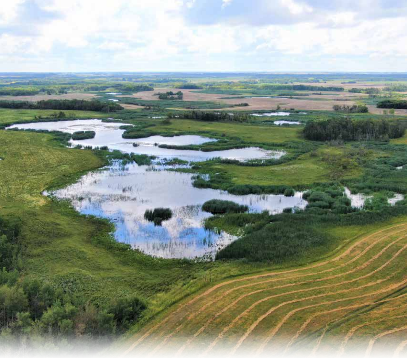
Conserved land south of Elkhorn MB

Ducks Unlimited Canada can make your farm more profitable and sustainable, with programs backed by scientific research and on-farm testing.