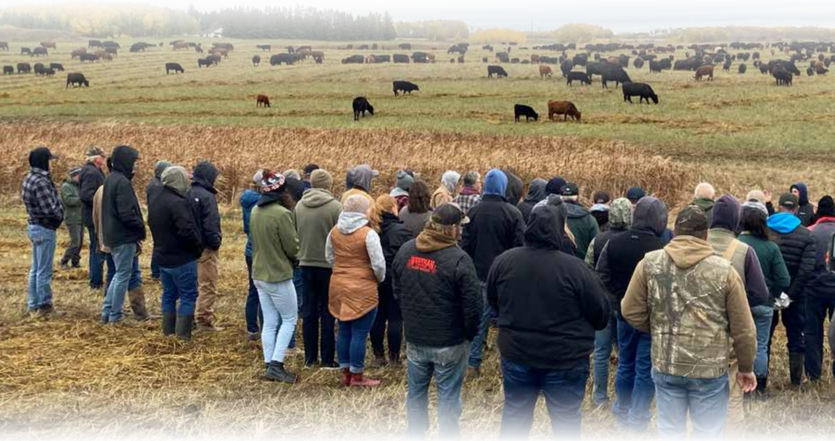
Grazing club tour showcasing swath grazing

For over 20 years, grazing clubs have brought Manitoba livestock producers together to find ways to make their farms more profitable.