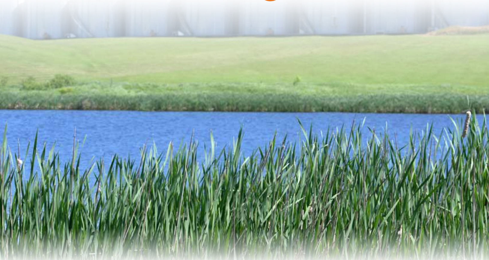
Conservation area on farmland near Erickson MB

A Conservation Agreement allows landowners to protect natural areas on their property, ensuring a natural landscape legacy for future generations.